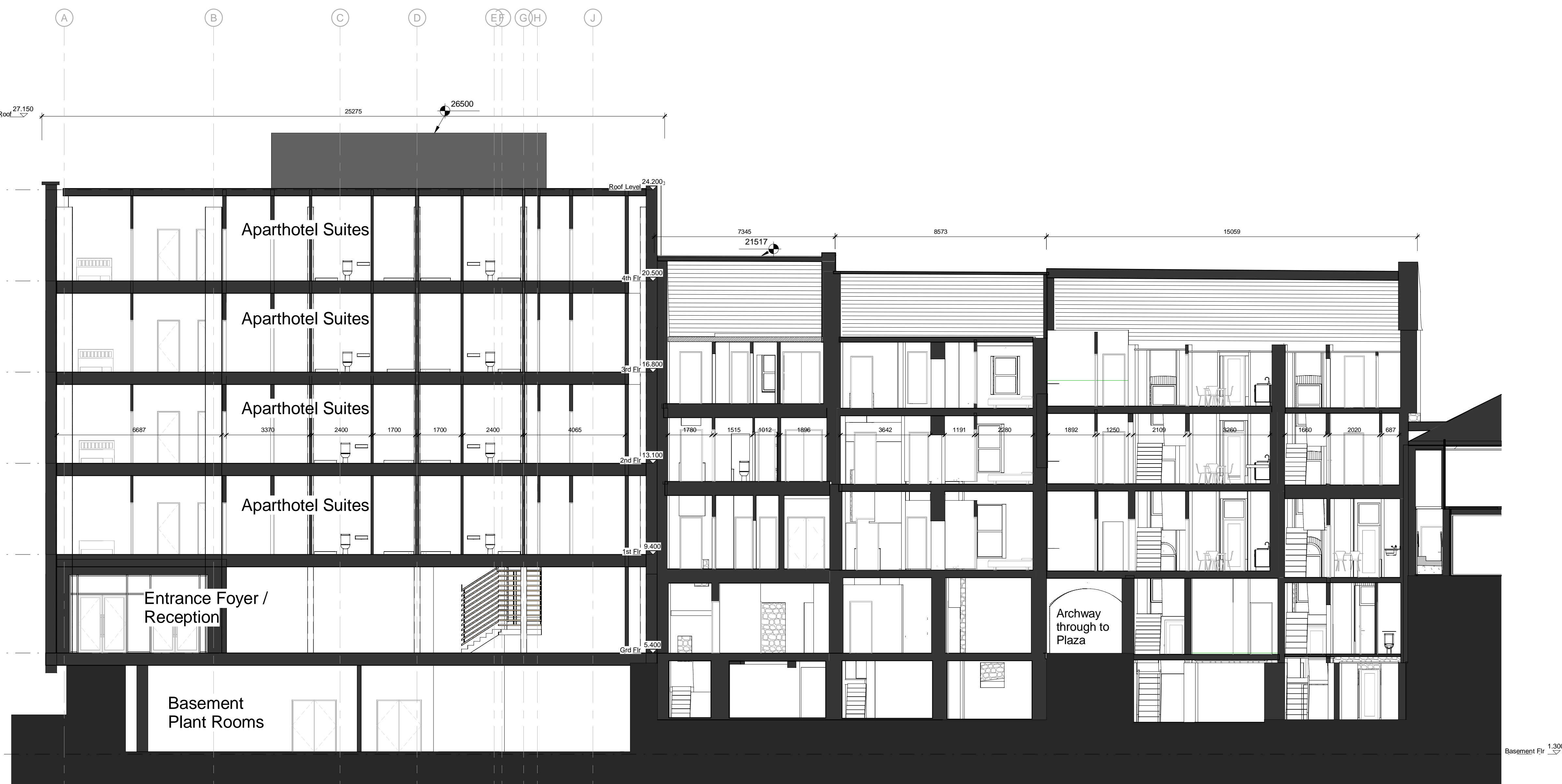
B-B Section through Ellen Street - Proposed SCALE: 1 : 100